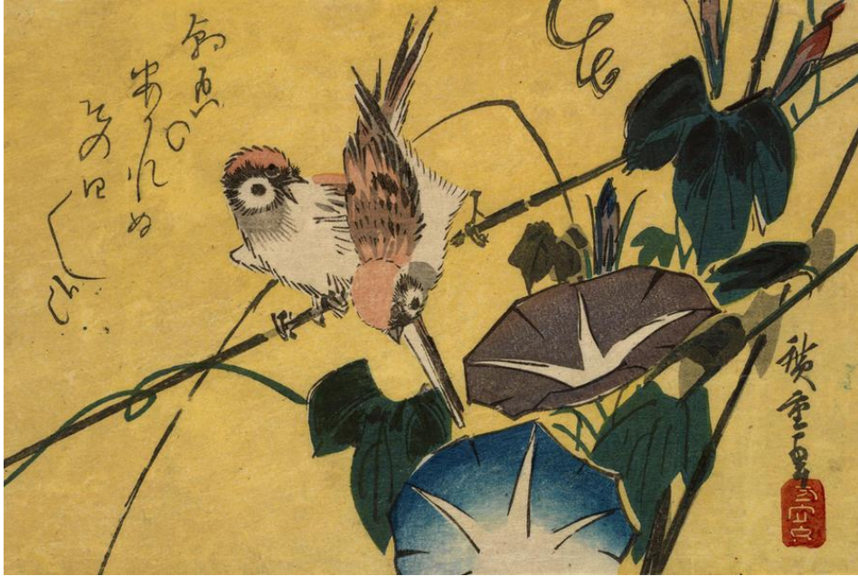
Utagawa Hiroshige, Tree Sparrows and Japanese Morning Glories , 1830s