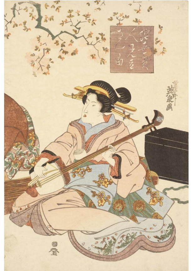
Keisai Eisen, Beauties of the Floating World as Three Musical Instruments , 1820s