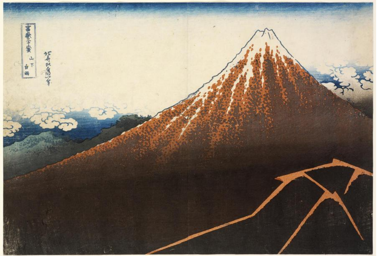
Katsushika Hokusai, Rainstorm Beneath the Summit , 1830-1831