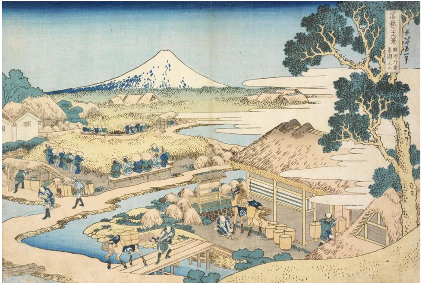
Katsushika Hokusai Mount Fuji from the Tea Plantation of Katakura, Suruga Province ca. 1833