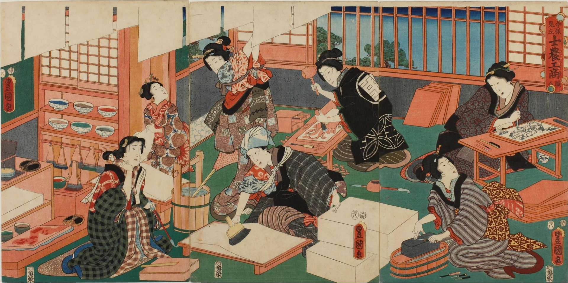
Utagawa Kunisada, Shokunin (Artisans) , 1857