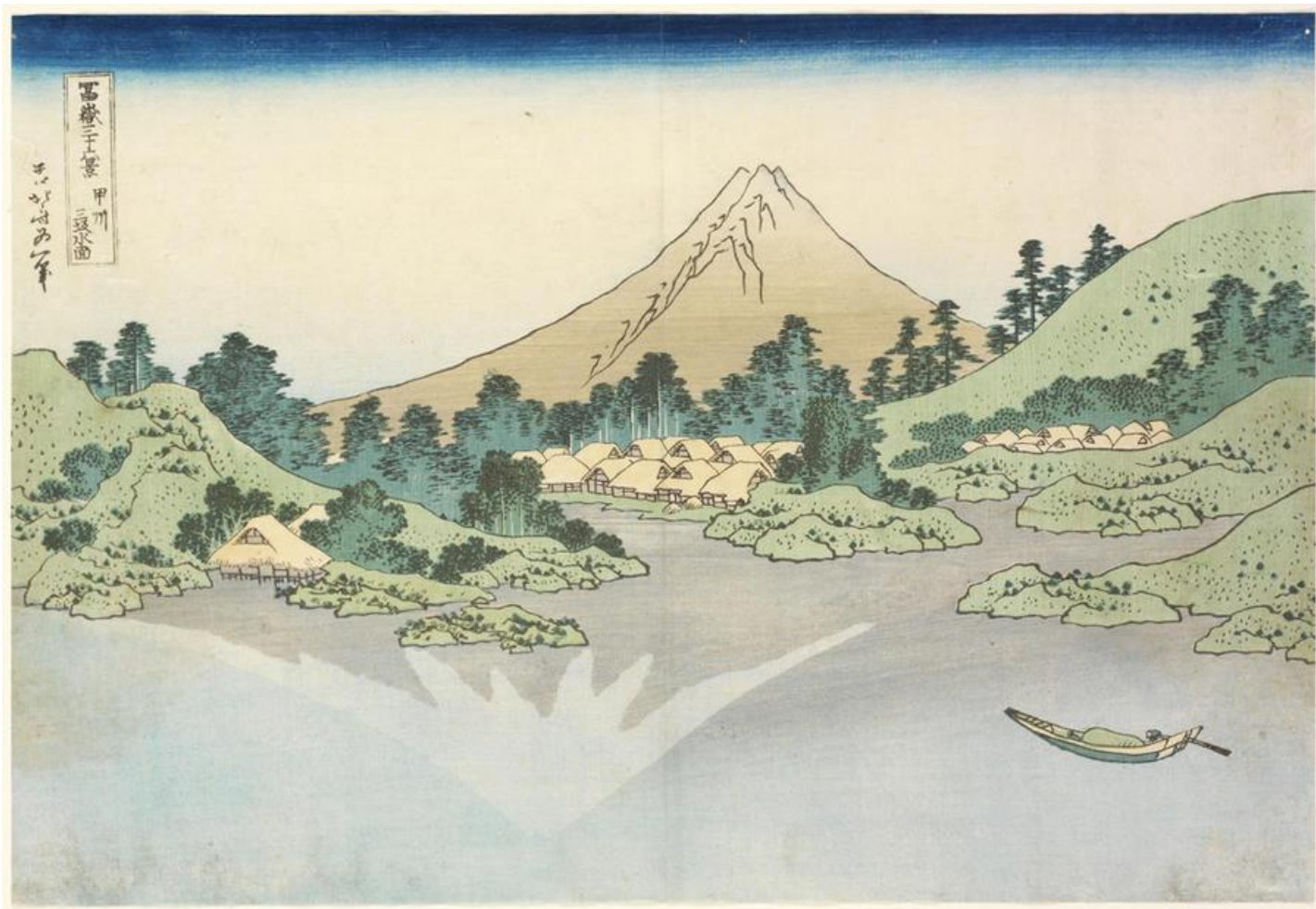
Katsushika Hokusai Reflection in Lake Misaka, Kai Province ca. 1833