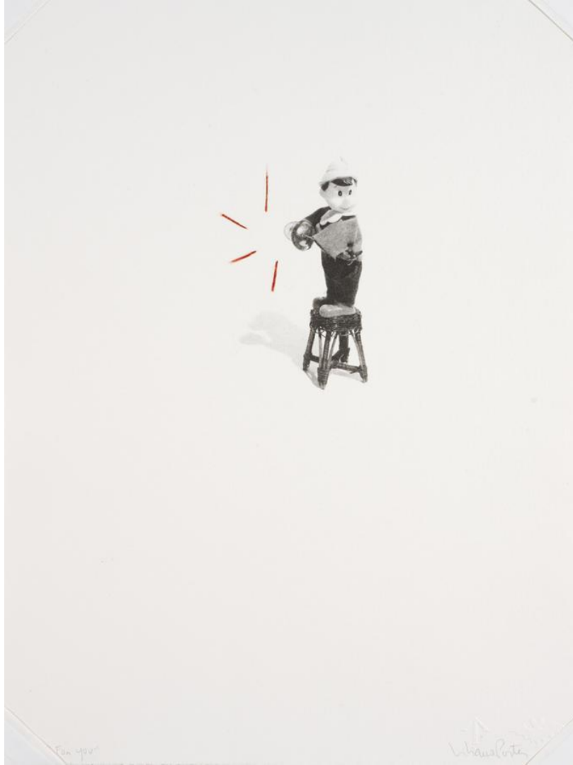
Liliana Porter For You , 2001