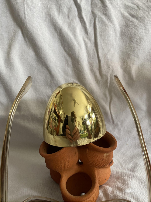
Why Would You Do That!?

➤ Repeat with different objects or scenes to create a series of 3–5 titled photos.