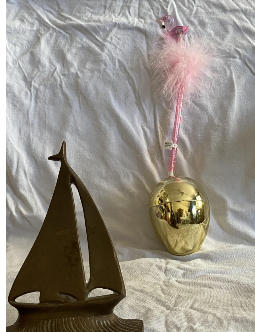
Bob's Long Journey Home to Flamingo Fuzzland