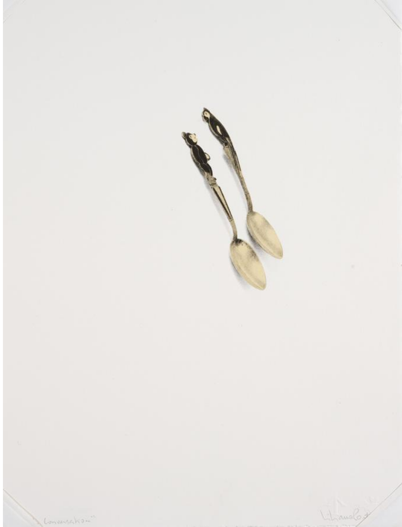
Liliana Porter The Conversation , 2001