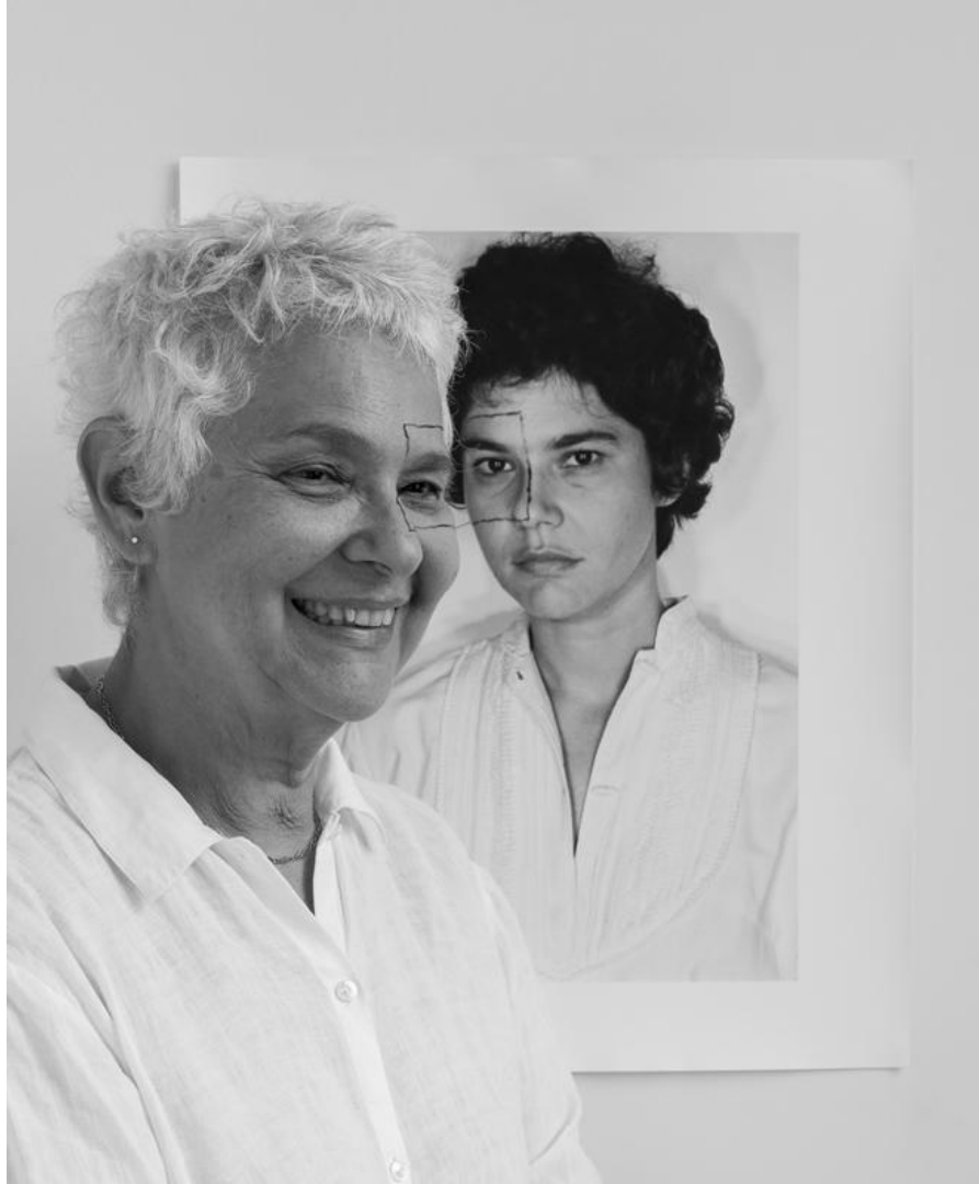
Liliana Porter Forty Years (self portrait with square 1973) 2013