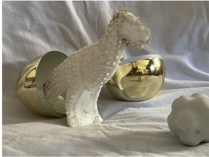
I Was Born, Now I'm Bored.