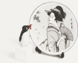
Liliana Porter The Offering , 2001