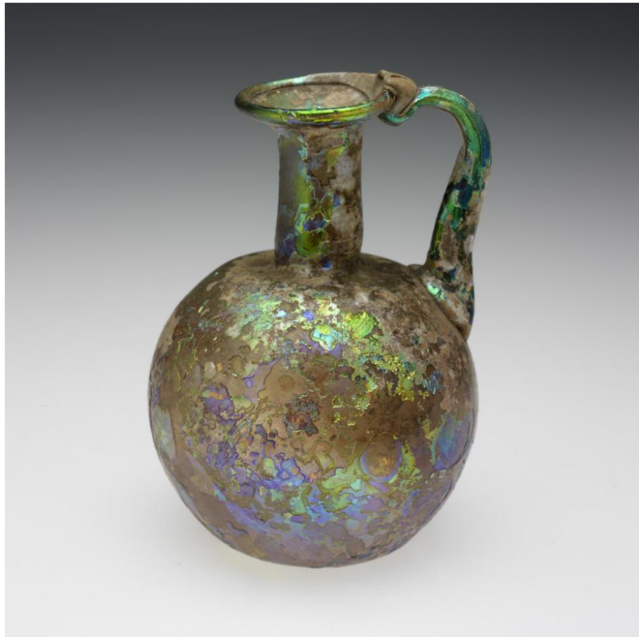
Roman, Glass Pitcher , 100s CE