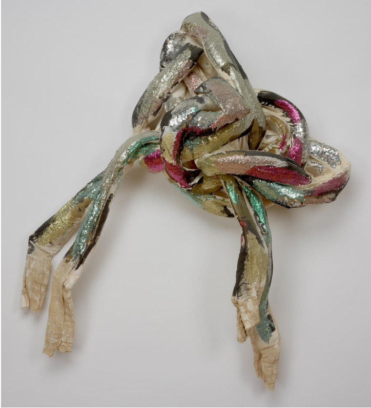
Lynda Benglis, Zita

Materials: Cotton cloth, aluminum screen, plaster, acrylic paint and glitter