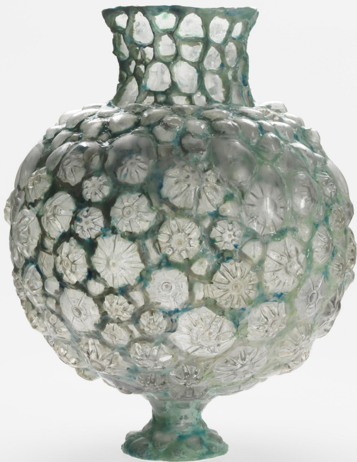
Shari Mendelson Round Blue/Green Vessel 2015