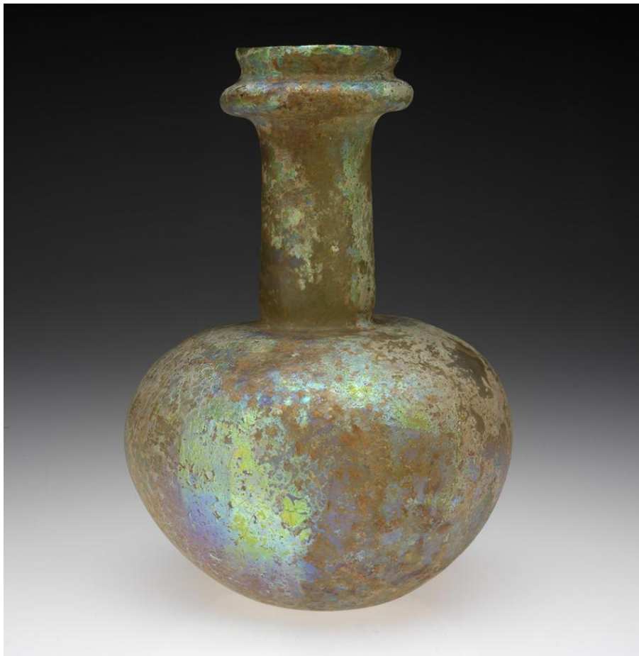
Roman, Glass Bottle , 2nd-3rd century CE