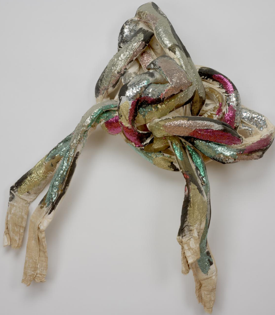
Lynda Benglis Zita from the Sparkle Knot series 1972