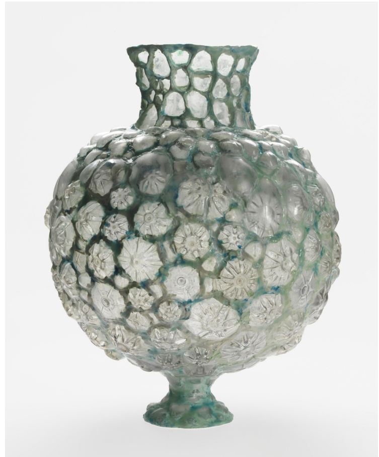
Shari Mendelson, Round Blue/Green Vessel